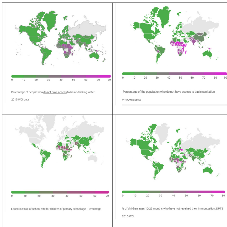
Figure 1: Coverage of minimum core economic, social and cultural rights; water, sanitation, primary school education, essential vaccination. 69